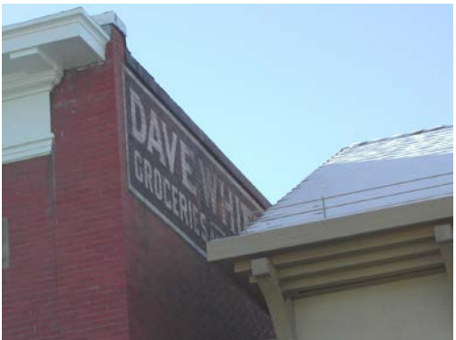
Photo 24 - Sign on North façade from Banff Avenue