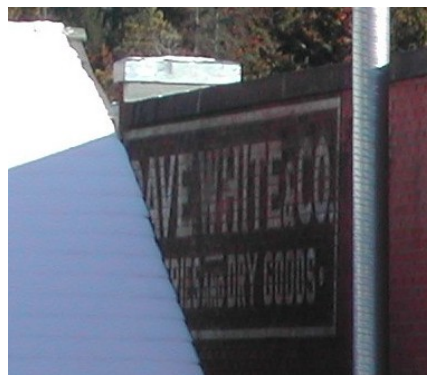
Photo 25 - Sign on North façade from lane