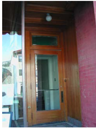
Photo 20 - Side entrance