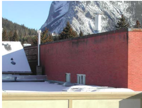
Photo 23 - North façade from lane