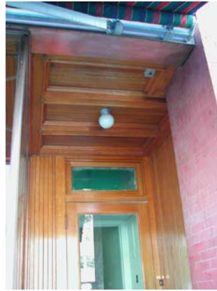
Photo 21 - Side entrance