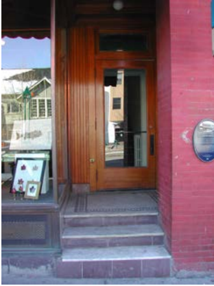
Photo 19 - Side entrance