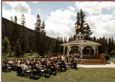
Central Park Gazebo